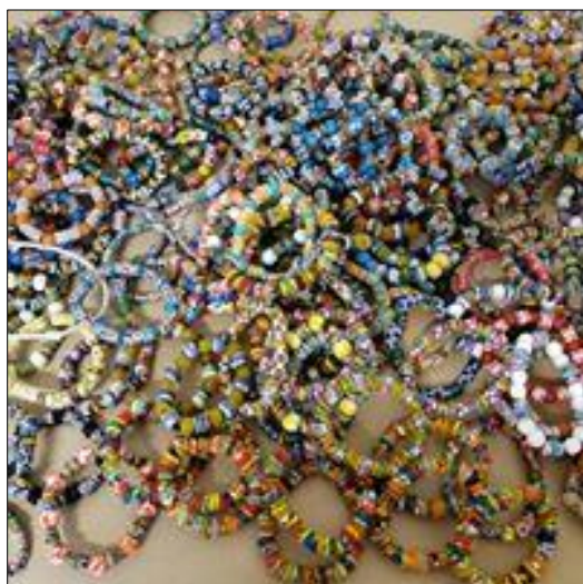
Krobo bead bracelets – each bead is made individually from powdered glass or seed beads that are melted in a horno-style furnace.