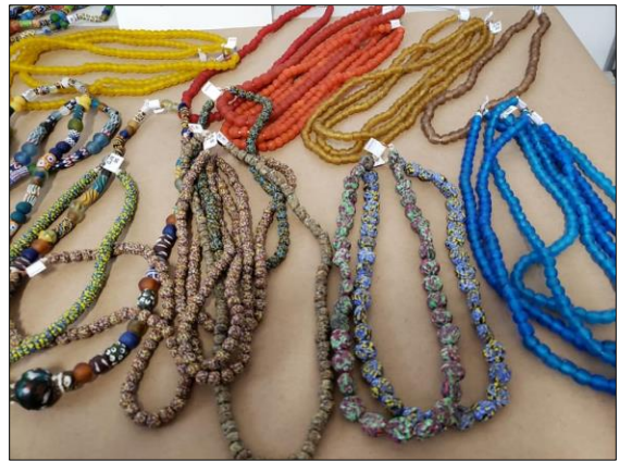
Strands of African-made powdered-glass beads.